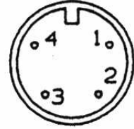
PIN VIEW NC4FX