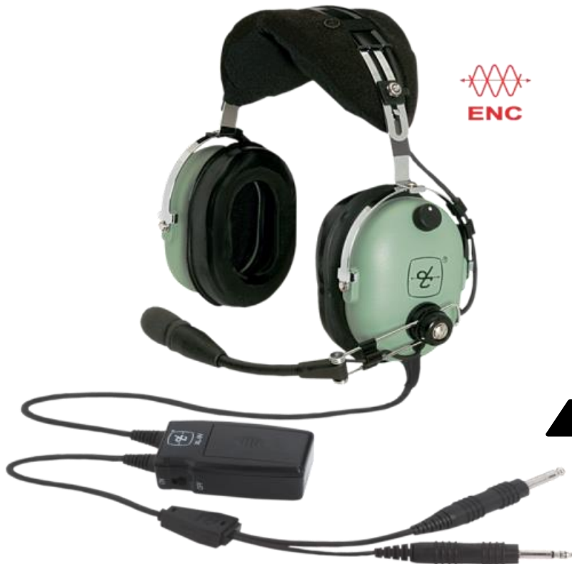
Model H10-13X Aviation Headset