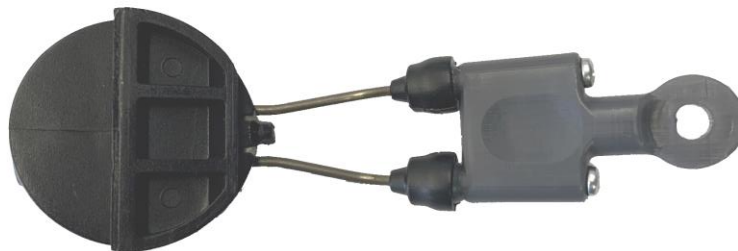
22610G-01 Conversion Kit

Visit us at WWW.DAVIDCLARK.COM to view product details and specific helmet compatibility.