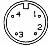
PIN VIEW NC4FX