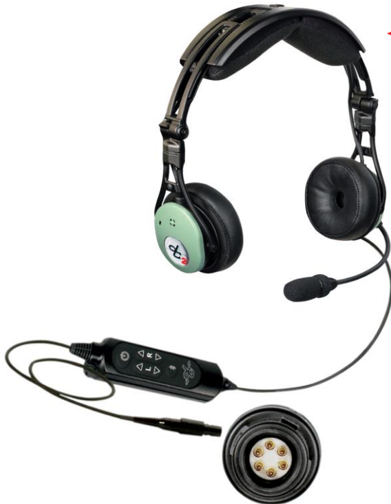
DC PRO-X 2 Headset