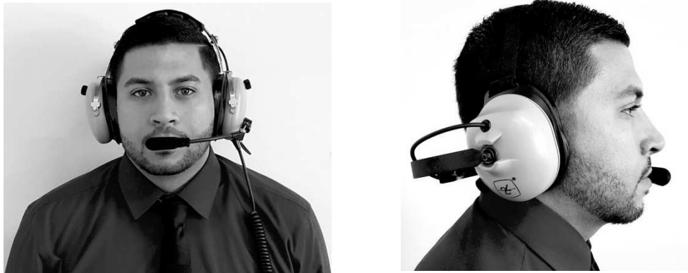
Figure 2: Positioning the Microphone